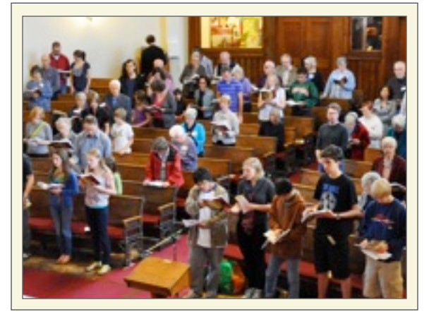
We call on all people of faith to rise up for climate justice