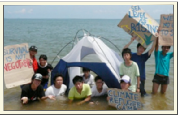
Calls for help from people bearing the brunt of climate impacts regularly go unanswered