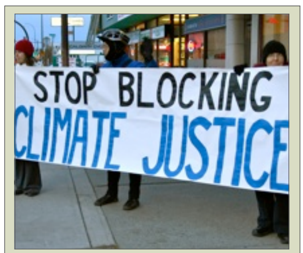
Canadian governments continually ignore demands for climate justice