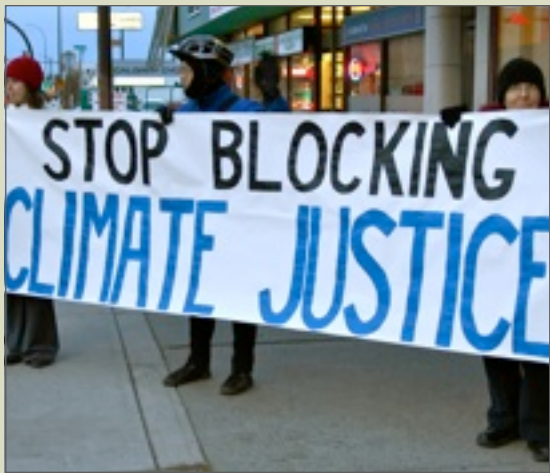
Canadian governments continually ignore demands for climate justice

Divestment firmly declares, "No!" to the federal government's and the fossil fuel sector's laissez-faire approaches to climate chaos. Divestment creates the market signal that companies need to change their behaviour. A large, mobilized, divestment campaign signals to fossil fuel-friendly governments and companies that their social license to operate has expired. Divestment tells companies and governments they need a new approach to climate justice.